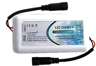
Dimming Receiver Module